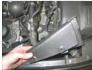
Fig. # 19