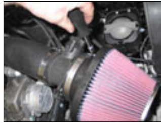
Fig. # 15