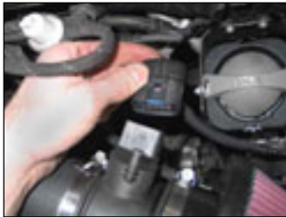
Fig. # 17