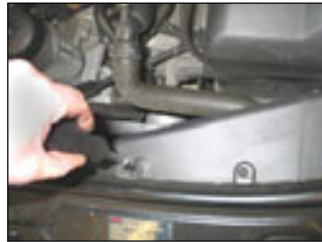
Fig. # 18