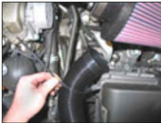
Fig. # 21