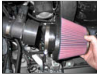
Fig. # 14