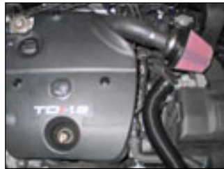
Fig. # 22