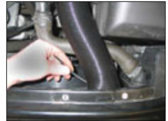
Fig. # 20